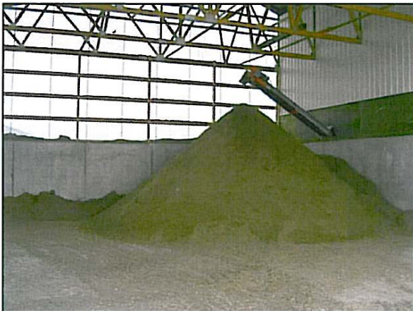
Phase 3 Sell electricity and useful process heat and by-products such as compost and liquid waste streams to be used as a fertiliser.