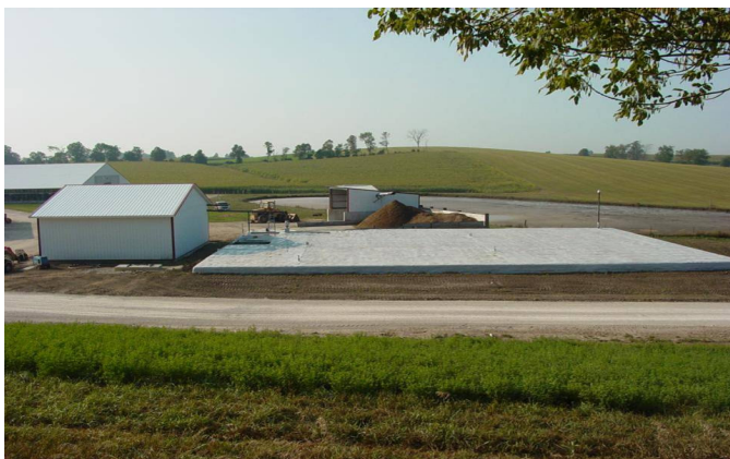
A Typical 300kW underground Anaerobic Digester Plant

New developments in the affordability and the size of anaerobic digester plants are being made every day making the possibility of installing this technology more attainable.