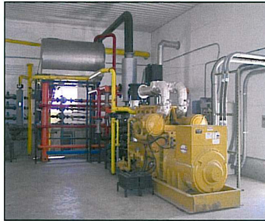
Phase 2 Construct an above or below ground plant space comprising the electrical generator and heat distribution plant.