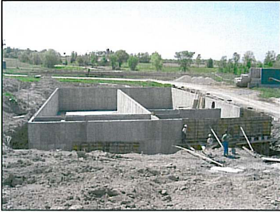
Phase 1 Construction of a safe sealed underground mixed plug flow digester. Hidden from view.

In addition to this, action through DEFRA promoting grants to assist with capital costs and capital allowances in the tax regime, together with the value of the energy produced have encouraged financial viability.